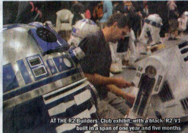
AT THE R2 Builders' Club exhibit, with a Black R2-V1 built in a span of one year and five months